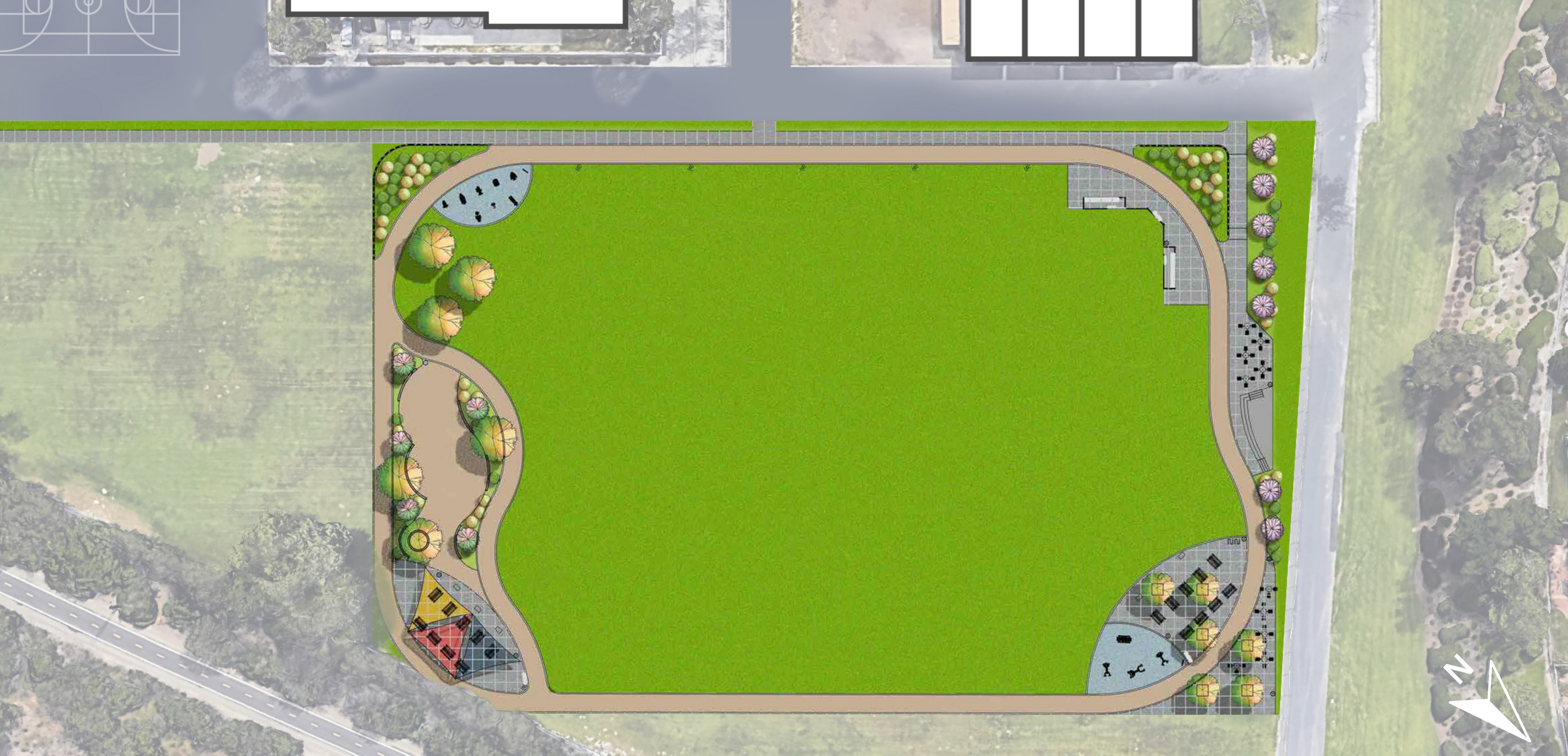
New Sports DG Running Track