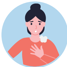
Shortness of breath or trouble breathing