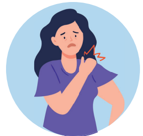
Fatigue (feeling tired), muscle or body aches