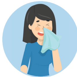
Congestion or runny nose