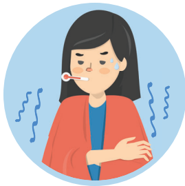
Fever or chills