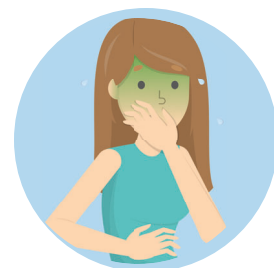
Nausea, vomiting, or diarrhea