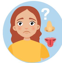
New loss of taste or smell

Symptoms can appear 2-14 days after exposure.