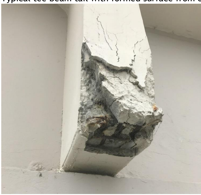
Tee beam tail with ends of tendons exposed:

Typical tee beam tail with formed surface from original pocket visible: