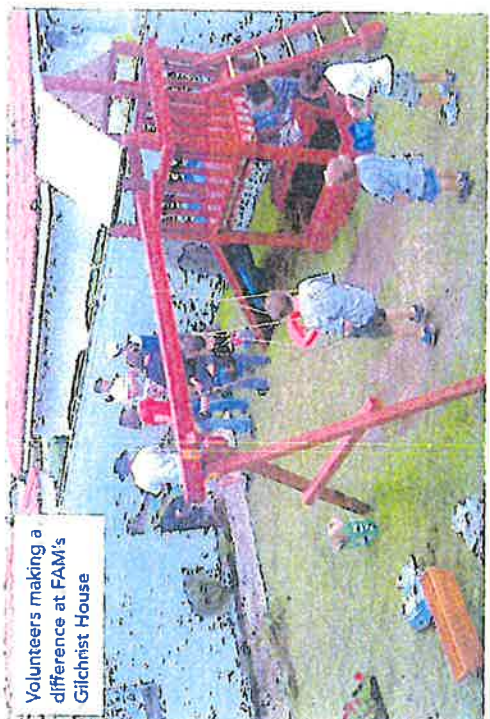
Volunteers making a difference at FAM's Gilchrist House